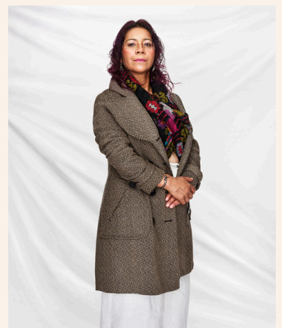
COUNCIL DISTRICT 14 HONOREE