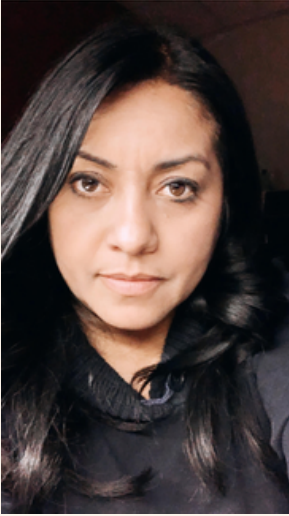
COUNCIL DISTRICT 13 HONOREE