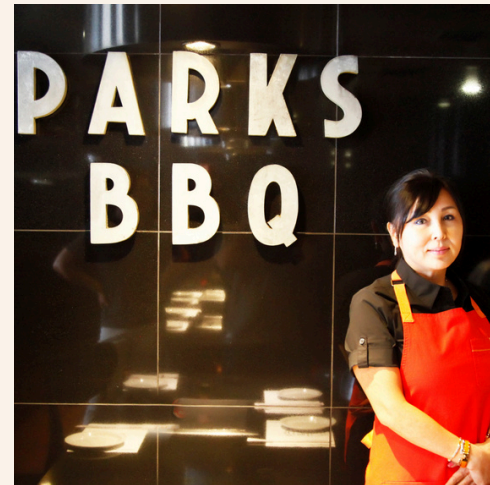
COUNCIL DISTRICT 10 HONOREE