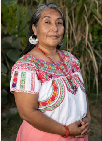
COUNCIL DISTRICT 9 HONOREE