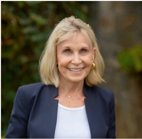
COUNCIL DISTRICT 11 HONOREE