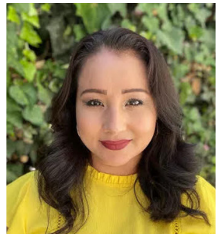
COUNCIL DISTRICT 13 HONOREE