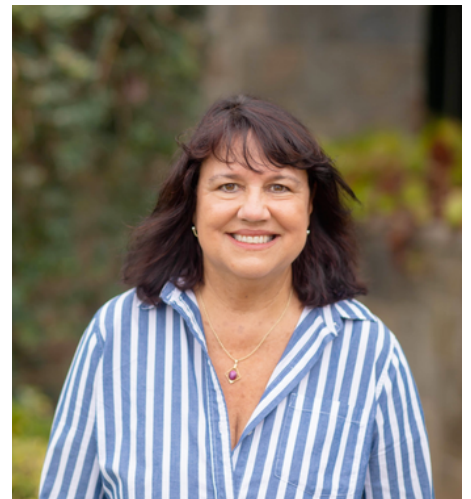
COUNCIL DISTRICT 11 HONOREE