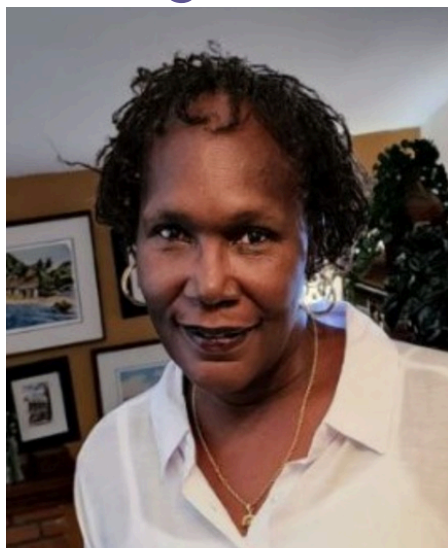
COUNCIL DISTRICT 3 HONOREE