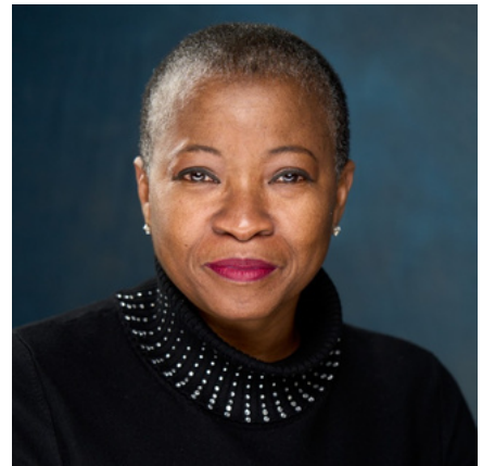
COUNCIL DISTRICT 8 HONOREE