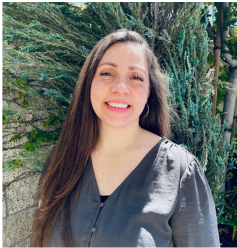
COUNCIL DISTRICT 12 HONOREE