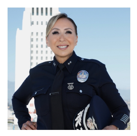
COUNCIL DISTRICT 12 HONORFF