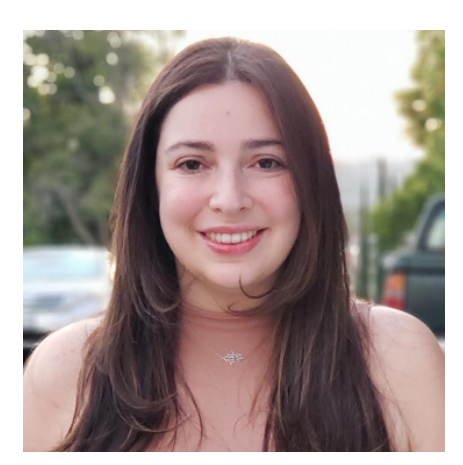
COUNCIL DISTRICT 14 HONOREE

In November 2018, she was elected to serve as President of the Highland Park Heritage Trust for a term beginning in January of 2019. In addition to leading the organization through the challenges of the COVID-19 Pandemic, she also led the organization through the successful years-long effort of the Historic Cultural Monument Nominations of two of the buildings associated with the Chicano Arts Collectives of Highland Park: the Centro de Arte Publico and Mechicano Art Center. She is currently leading the organization through a National Register Nomination for sites associated with the Chicano Blowouts. She also serves on the board for Art in the Park Los Angeles, which provides low- and no-cost arts and music programming to our Northeast and Eastside communities.