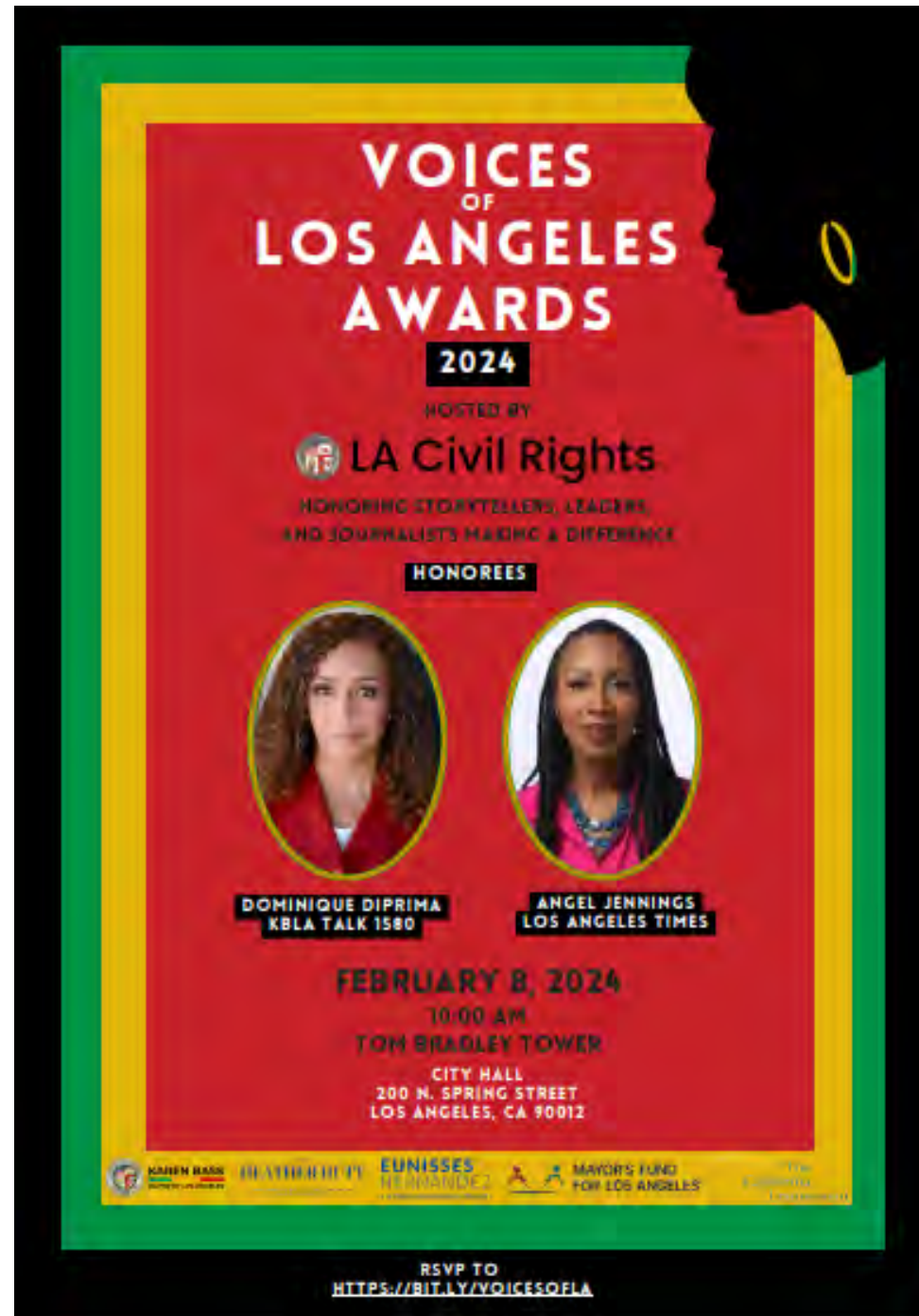
Voices of Los Angeles Awards February 8, 2024, at 10:00 A.M. Location: Tom Bradley Tower