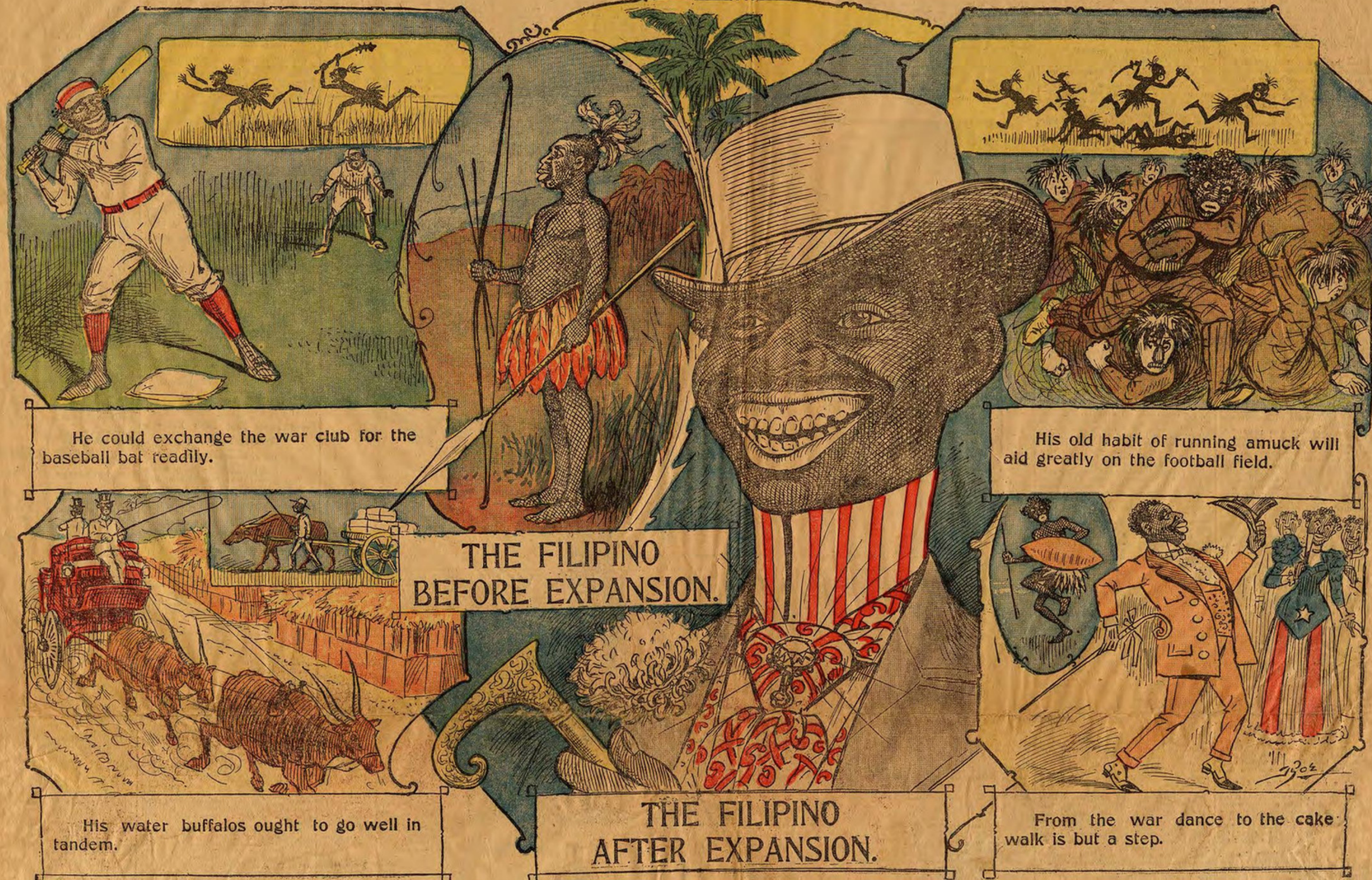
He could exchange the war club for the baseball bat readily.